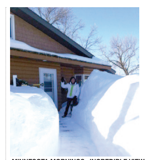
MINNESOTA MORNINGS...INCREDIBLE VIEWS! Mounds of snow were a common scene through the windows of most lake residents this past winter season.