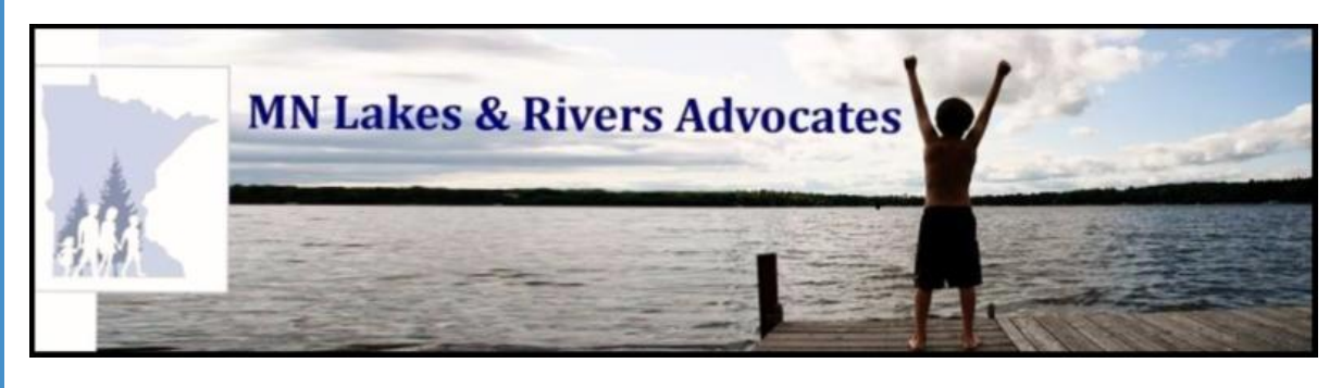
April 22nd, Koronis/Greater Lake Sylvia