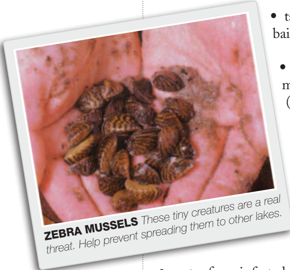
ZEBRA MUSSELS These tiny creatures are a real threat. Help prevent spreading them to other lakes.