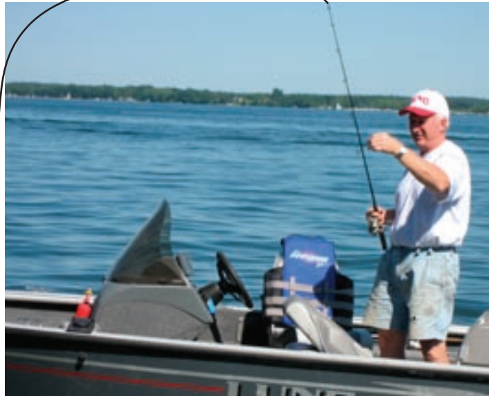
Good fishing adds to the quality of life on our group of lakes.