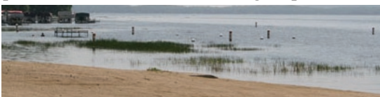
BIG DETROIT LAKE: The most visible area of Flowering rush is in the Detroit Lakes city beach.

(For specific information on their plan visit www.prwd.org ).