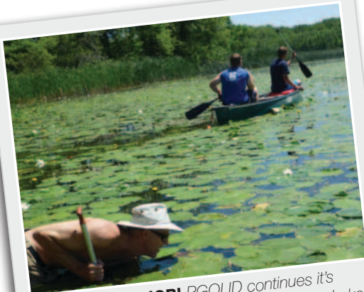
NOT A CLEAN JOB! PGOLID continues it's effort to keep Flowering Rush out of Pelican Lake.