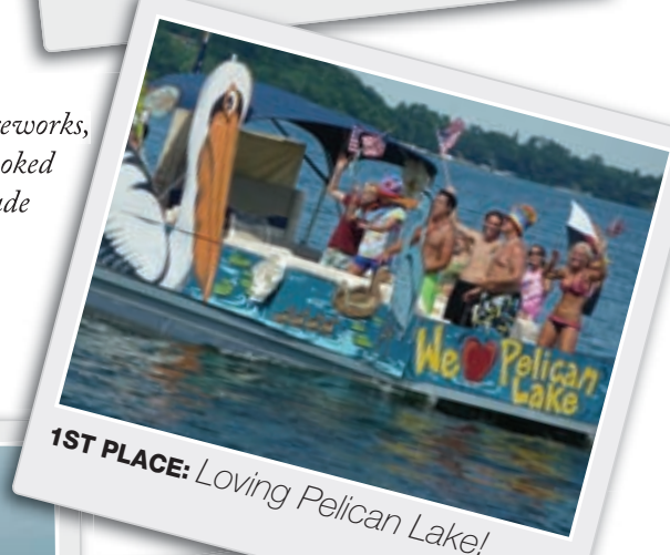
1ST PLACE: Loving Pelican Lake!