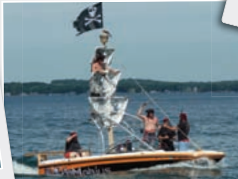
2ND PLACE (tie): Ahoy Matey!