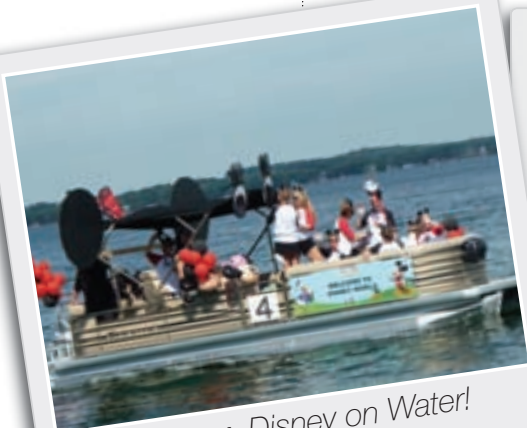
2ND PLACE (tie): Disney on Water!