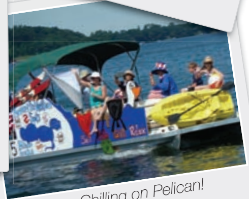
3RD PLACE: Chilling on Pelican!